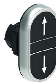
Double-touch actuators, spring return - two flush pushbuttons LPCB71